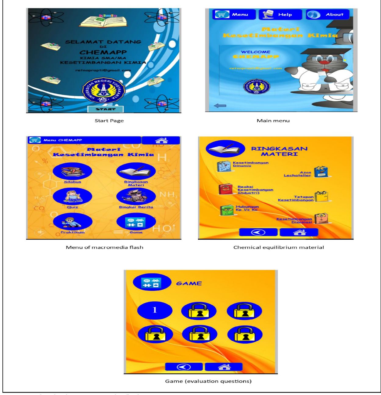
Figure 1: The display macromedia flash